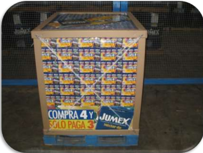
Cube in shipping mode