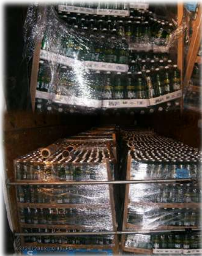
Without the Cube