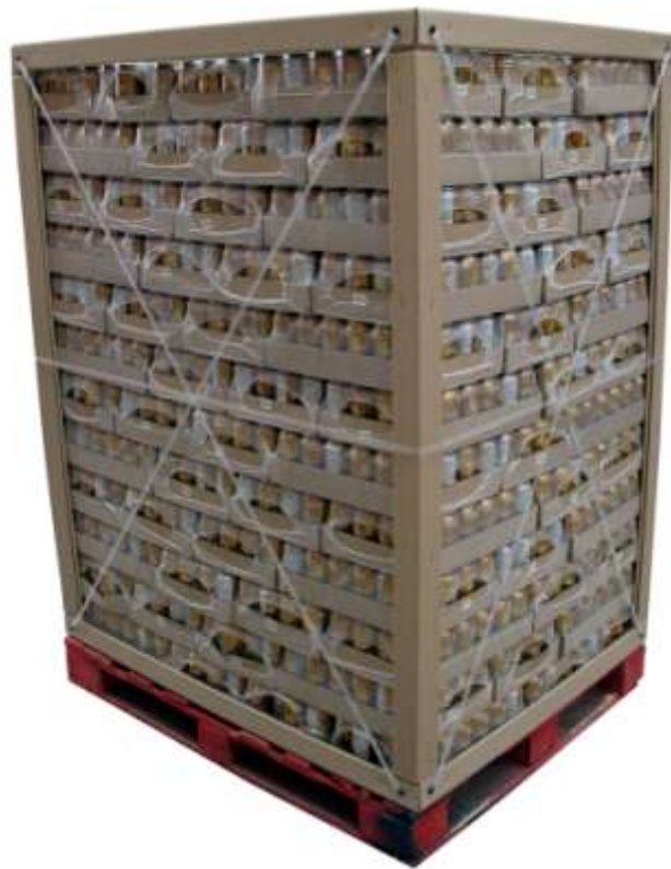
Beer shipped in the Cube