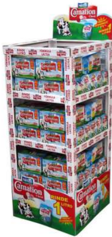
Cube Quarter Pallets